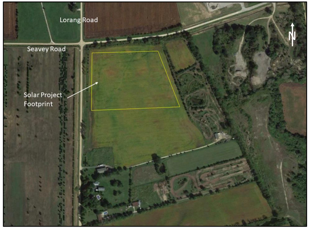
Figure 1. Diamond Solar Project Locus

The Diamond Solar Photovoltaic (PV) Project is proposed on 10 acres of undeveloped land southeast of the intersection of Lorang and Seavey Roads in Elburn, IL as shown on Figure 1 . The project will use a fixed tilt design and has a nameplate capacity of 2 MWac.