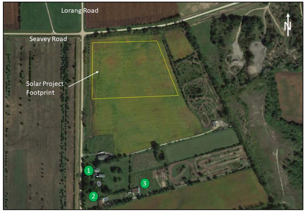
Figure 3. Residence Near the Diamond Project Analyzed for Glare

The sensitive receptors for analysis in this case are residences located just south of the project. The model's observation point tool was used to select individual points located on the Google Map for glare assessment. The observer location was set at 15 feet agl for the two-story dwelling to assess a second-floor view. Figure 3 shows the location of the three receptors.